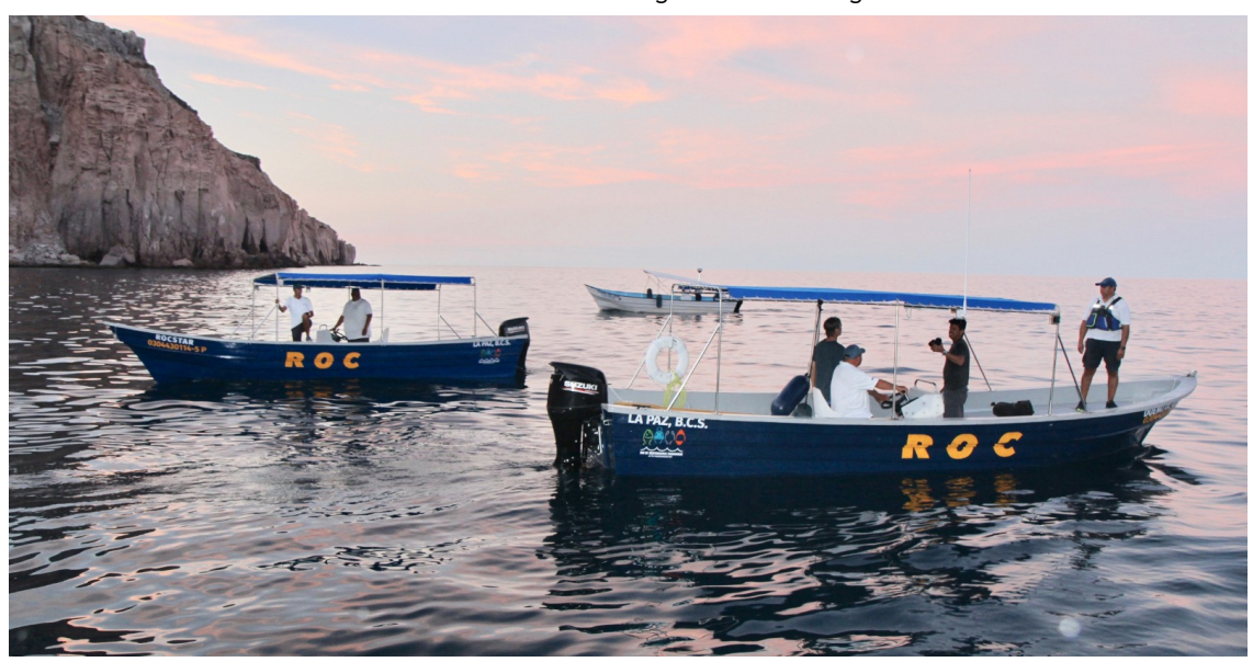
ROC vigilance patrols cover 330 miles of coastline last week

Last week, <u>ROC's three patrol boats</u> covered over 330 miles of coastline in the Bay of La Paz and South to Muertos. One boat going north to San Jose Island, another spent several days at the Espiritu Santo National Park while the third patrolled south around Cerralvo and Muertos Bay. <u>Click here to check their routes</u>.