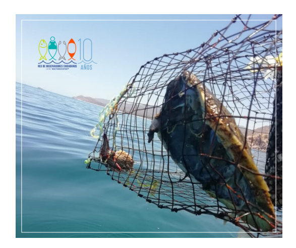
Unattended fish traps near Muertos Bay pulled by Conapesca w/ROC

Fish traps are becoming ubiquitous around La Paz and Muertos Bay areas and they are <u>indiscriminate killers of fish</u>. While legal there are restrictions on how they can be used. ROC is working with authorities to make sure that boats with traps are on site monitoring them. If not, or if the traps are left out at night, they are confiscated. ROC is working to minimize the damage and also involving the public in a discussion about trap use in the Espiritu Santo National park