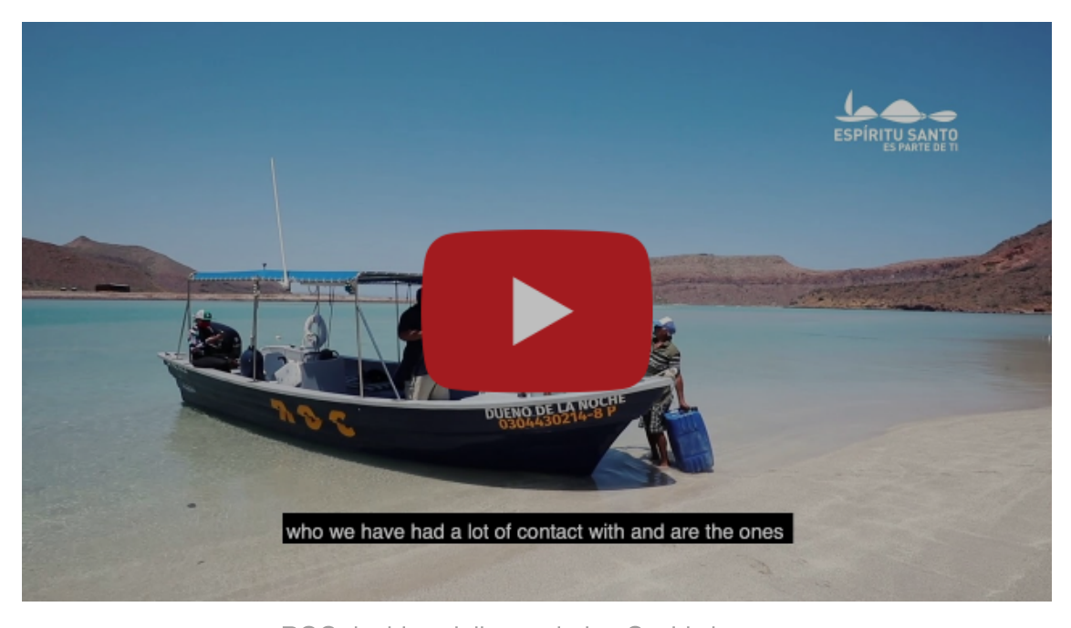
ROC doubles vigilance during Covid closures