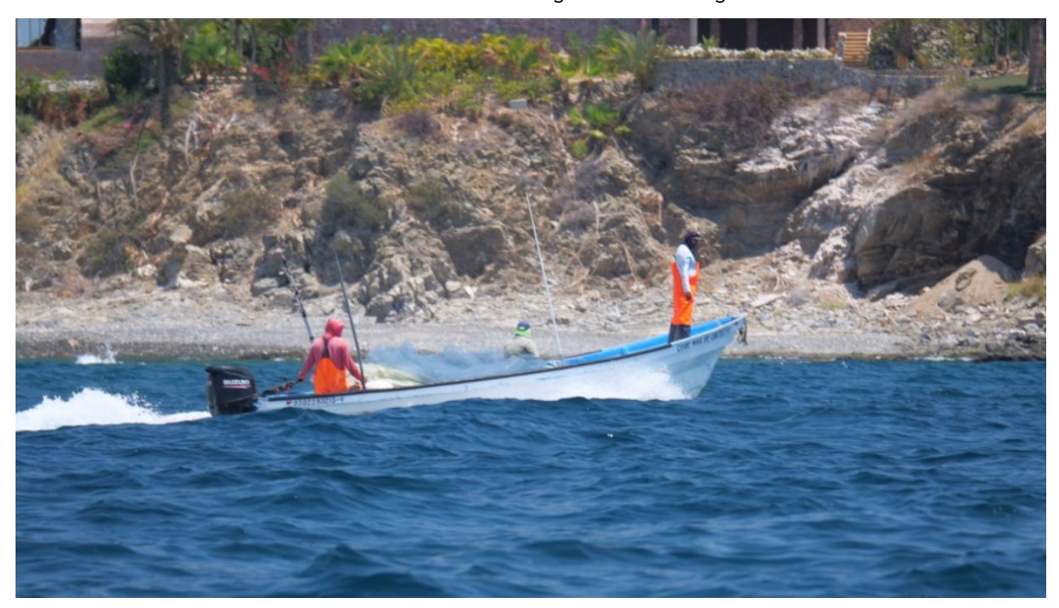
ROC working with local fishermen, stop Illegal fishing from Mulege

A fleet of pangas from Mulege arrived in June to the Muertos/Ventana area as the have in years past to target Sabalo (aka Lady Fish). Sabalo is what the Rooster fish eat and Rooster fish are a mainstay of sport fishing in the area. ROC found the boats were also fishing illegally on the reefs and due to ROC's constant presence all 6 boats left the area a month and a half earlier than normal.